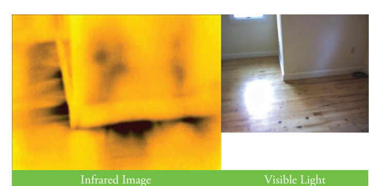
The bright yellow shows the hotter warm floor and insulation. The darker spots reveal the leaks from under the baseboard and the loss of heat through the studs.