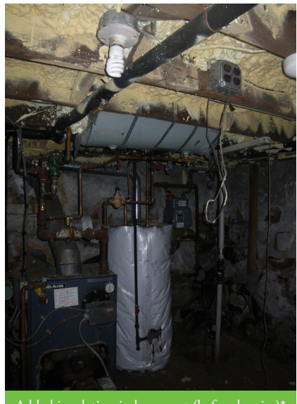
Added insulation in basement (before barrier)