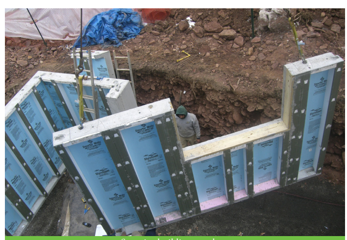
Superior building envelope