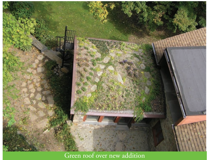
Green roof over new addition